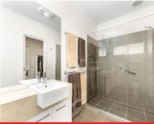
48 Omega Drive OCEAN GROVE, VIC